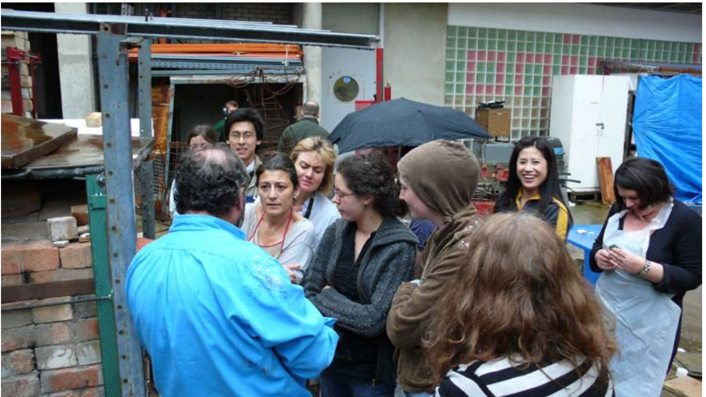
Camberwell College of Arts - april/july 2007 Artist-in-residence at the ceramic department. London. UK.