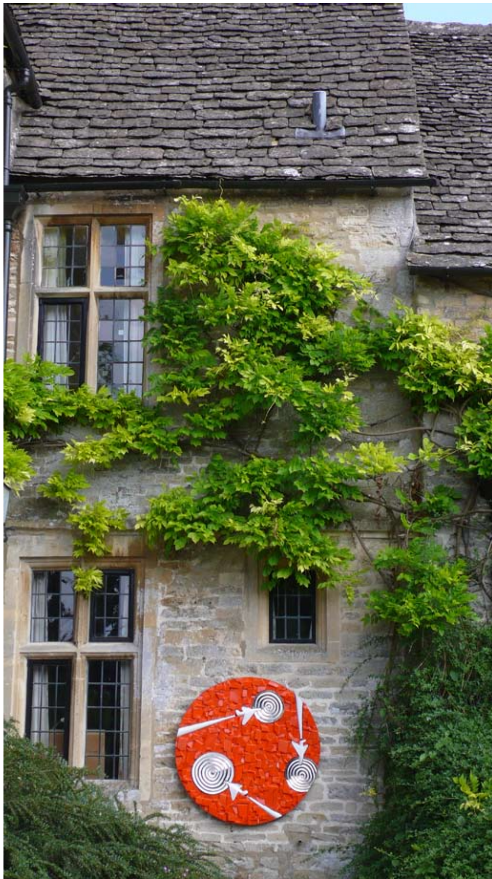
Camberwell College of Arts - april/july 2007 Artist-in-residence at the ceramic department. London. UK.