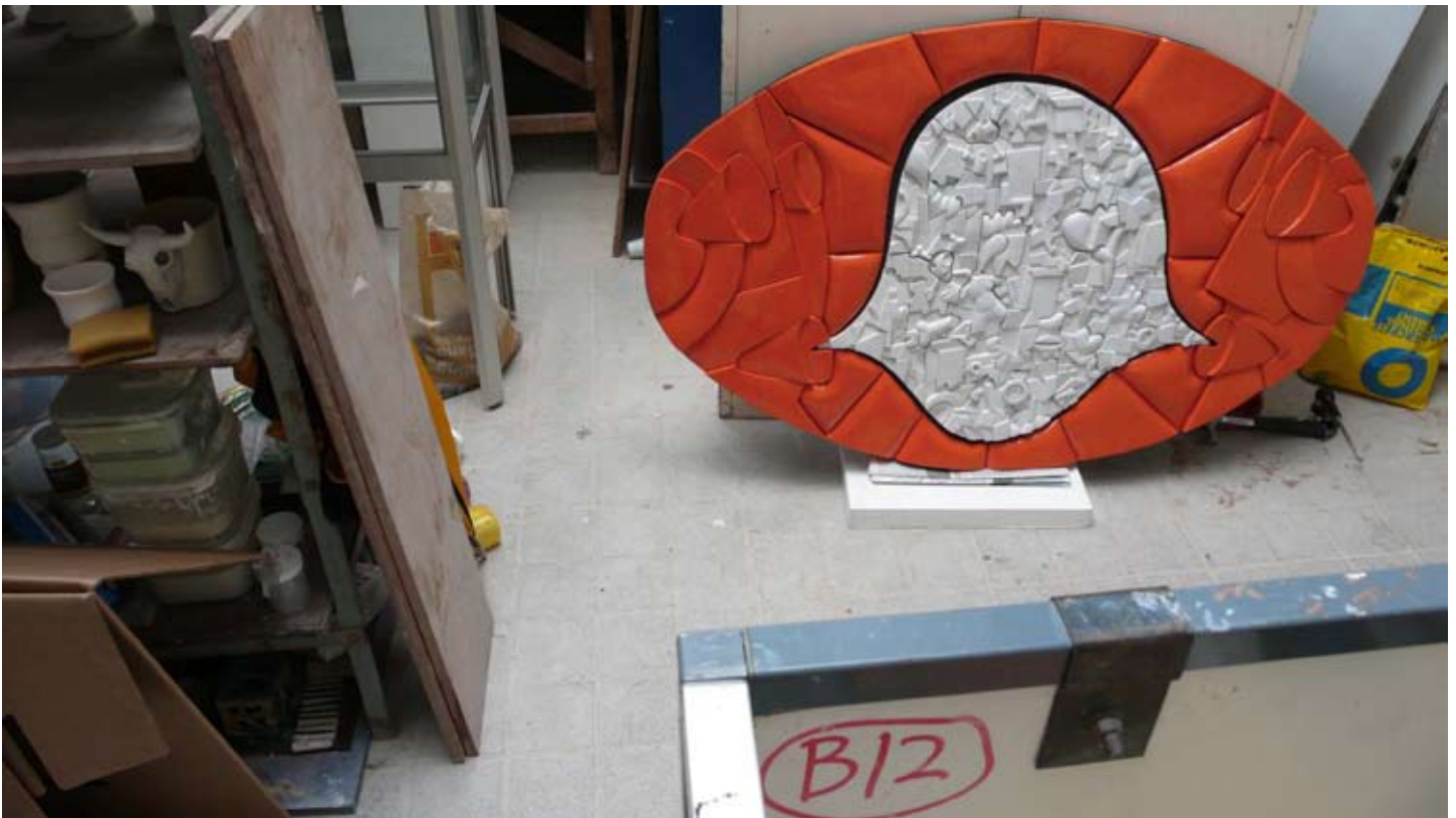
Camberwell College of Arts - april/july 2007 Artist-in-residence at the ceramic department. London. UK.