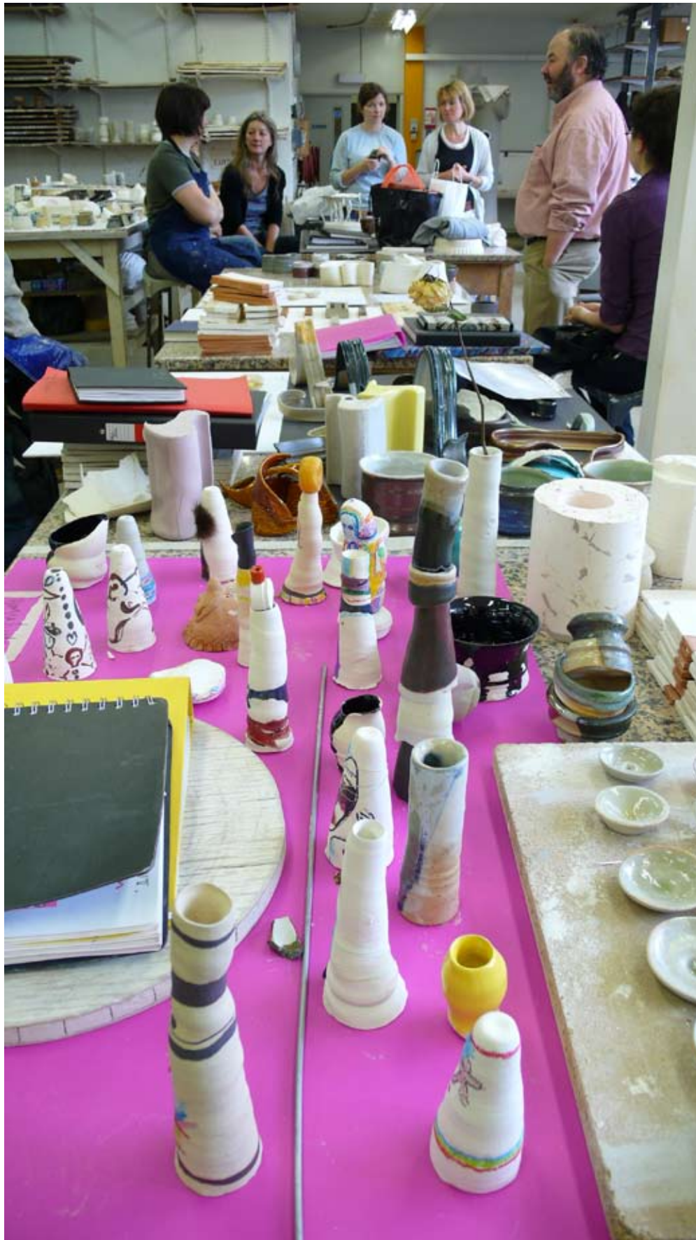
Camberwell College of Arts - april/july 2007 Artist-in-residence at the ceramic department. London. UK.