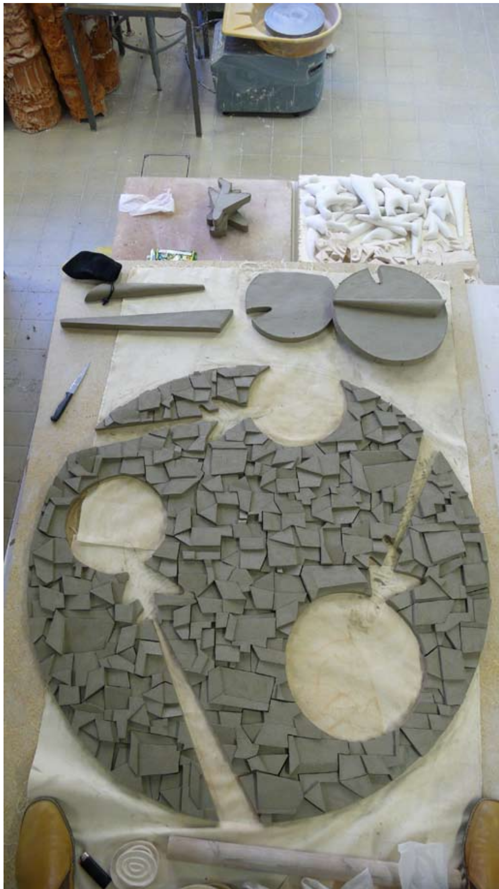
Camberwell College of Arts - april/july 2007 Artist-in-residence at the ceramic department. London. UK.