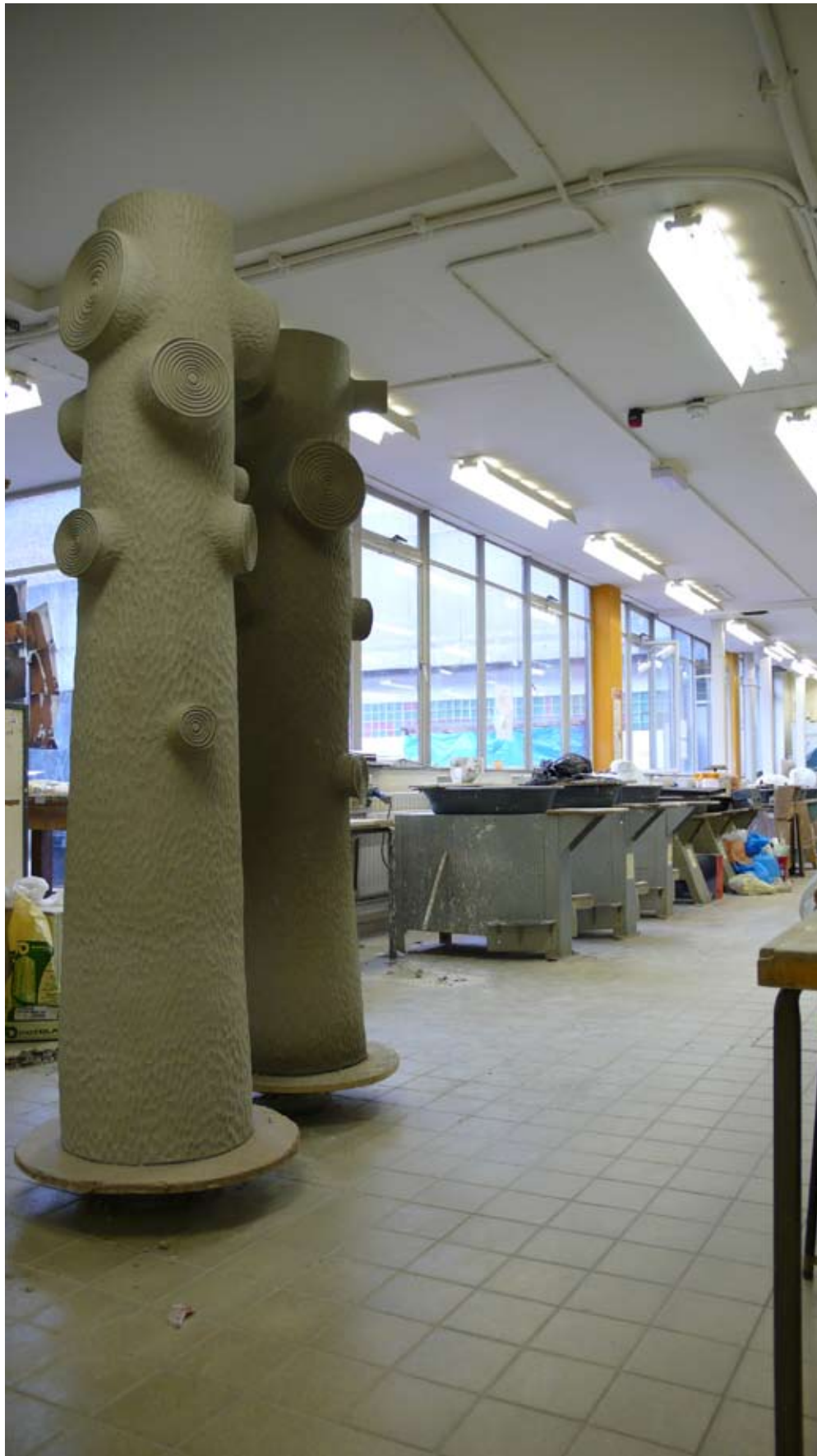
Camberwell College of Arts - april/july 2007 Artist-in-residence at the ceramic department. London. UK.