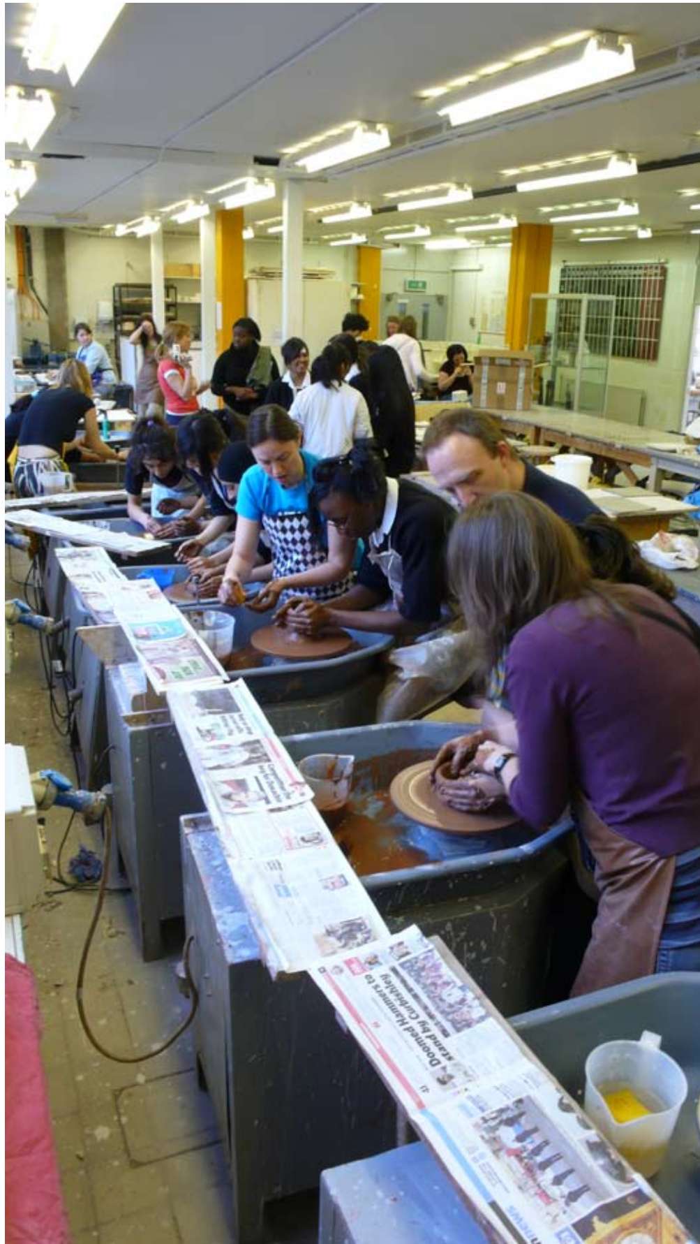
Camberwell College of Arts - april/july 2007 Artist-in-residence at the ceramic department. London. UK.