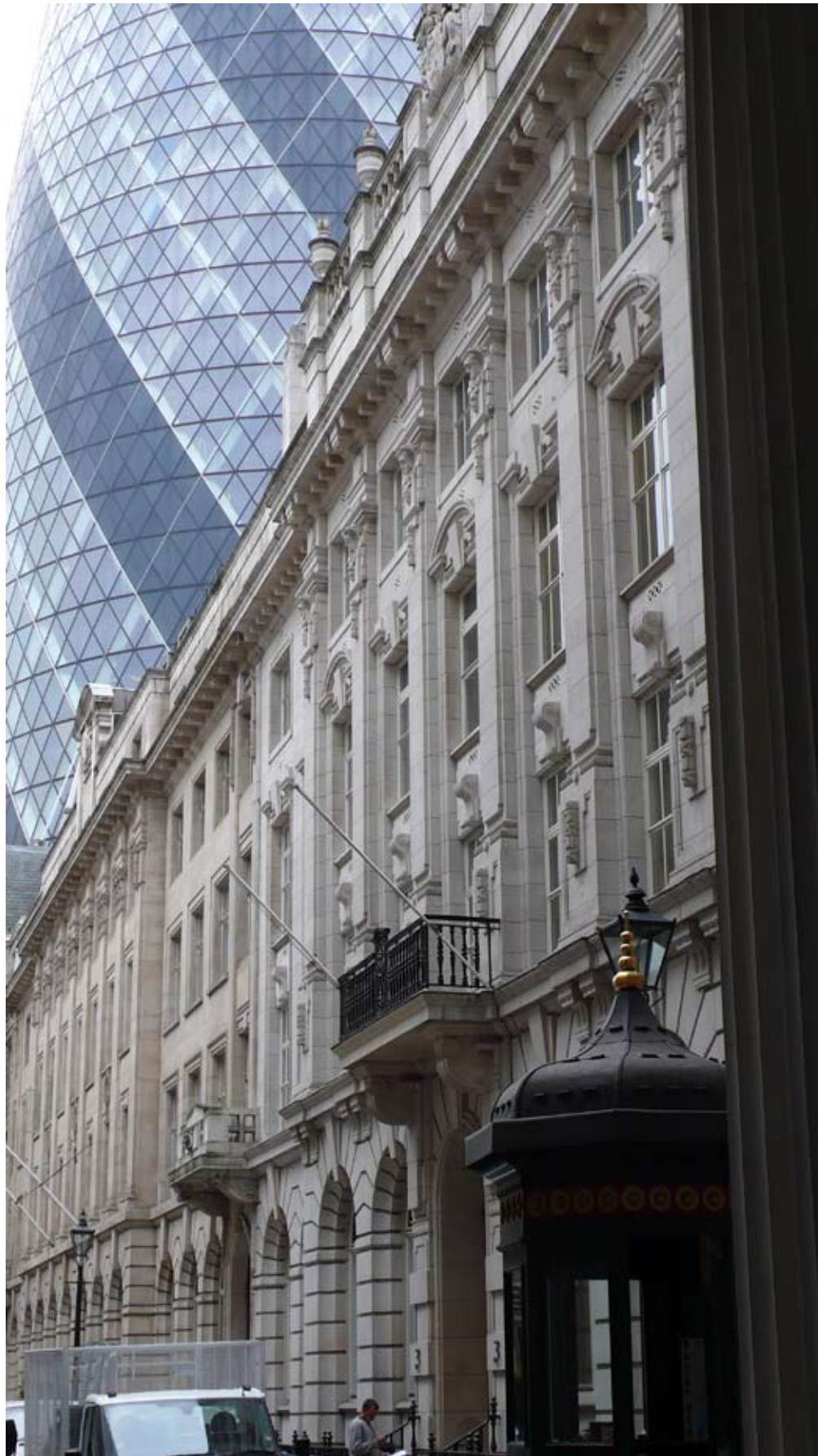
Camberwell College of Arts - april/july 2007 Artist-in-residence at the ceramic department. London. UK.